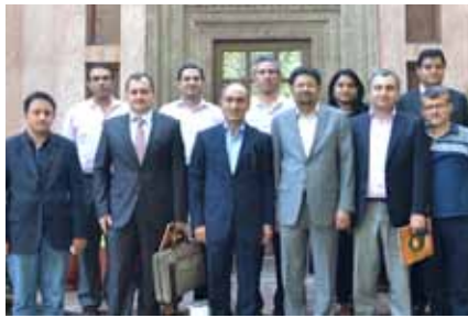
Visit of Turkish Businessmen (Pak-Turk Business Forum)