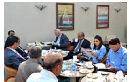
Visit of Canadian Mining and Energy delegation