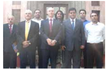
Visit of Australian Trade Commissioner (AUSTRADE)