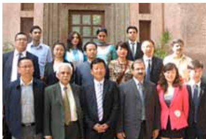
Visit of team of Nan Chuan Industrial Park, China

Power & Alternative Energy Asia is proven to be the preferred venue for buyers to source for new technology and equipment and where industry professionals get updated on the latest technological advancement and industry trends. For more information, Power & Alternative Energy Asia Secretariat may kindly be contacted on tel: (021) 111-222-444, fax: (021) 3453-6330 or email: info@powerasia.com.pk or browse www.powerasia.com.pk for booking and for downloading the Participation Tariff, Sponsorship Packages & Advertising Opportunities at the Event.