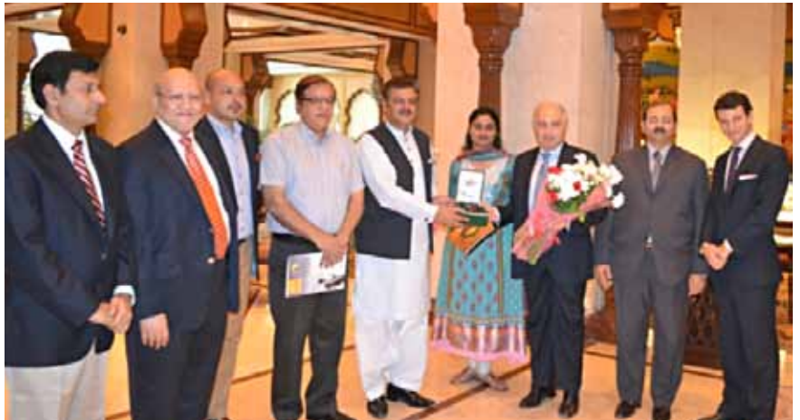
Luncheon meeting with the Italian Ambassador